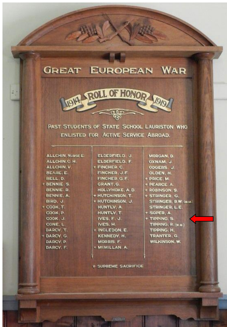
Lauriston State School Roll of Honour