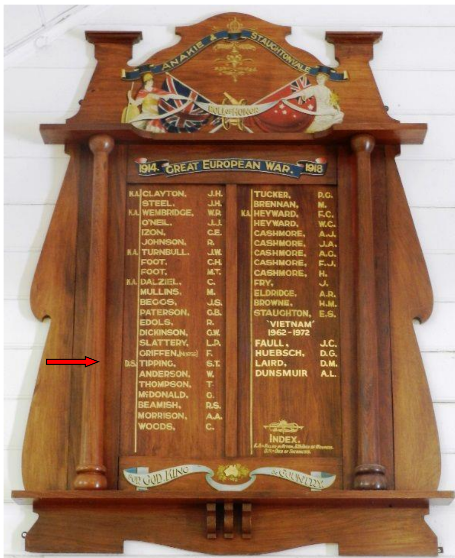
Anakie & Staughton Vale Roll of Honour

S. T. Tipping is remembered on the Anakie & Staughton Vale Roll of Honour, located in Anakie Hall, 27 Staughton Vale Road, Anakie, Victoria.